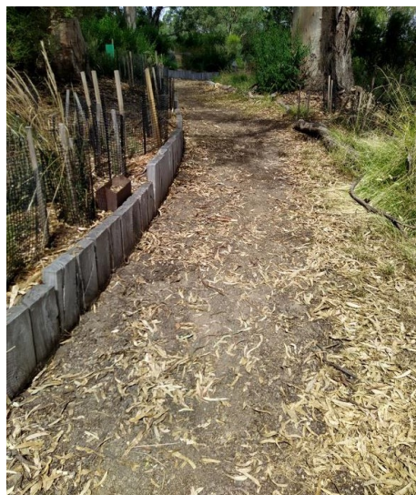
Before and after weeding the path in the garden, February 2023